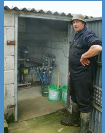
The farm's old electric pump and filter system.